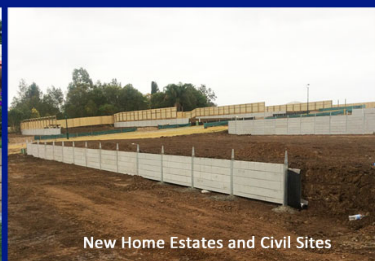
New Home Estates and Civil Sites

Building Retaining Walls For Over 15 Years